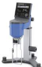
IKA Viscometers Measuring Viscosity