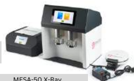
MESA-50 X-Ray Fluorescence Analyzer