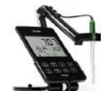
Hanna I-2030 edge Hybrid Multiparameter EC Meter