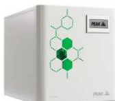
Hydrogen Gas Generator