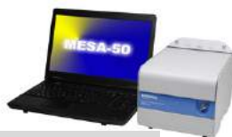
Horiba MESA-50 X-Ray Fluorescence Analyzer