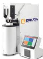
Falling Number Analyzer