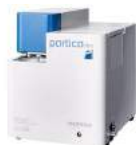
Horiba LA-350 Particle Analyser